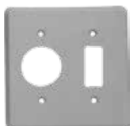
13PL51 23PL51 43PL51