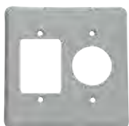
13PL35 23PL35 43PL35