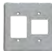
13PL32 23PL32 43PL32