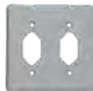
13PL11T 23PL11T 43PL11T