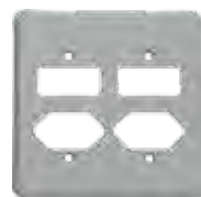
13PL22/2iT 23PL22/2iT 43PL22/2iT