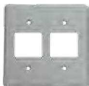
13PL22 23PL22 43PL22