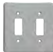
13PL11 23PL11 43PL11