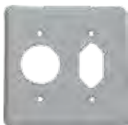
13PL5/1T 23PL5/1T 43PL5/1T