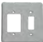
13PL13 23PL13 43PL13