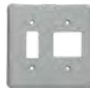
13PL12 23PL12 43PL12