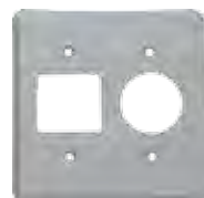
13PL25 23PL25 43PL25