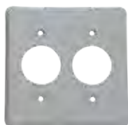
13PL55 23PL55 43PL55