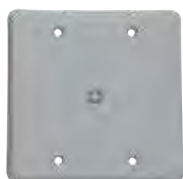
13PL00/66 23PL00/66 43PL00/66