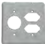
13PL5/2T 23PL5/2T 43PL5/2T