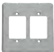
13PL33 23PL33 43PL33