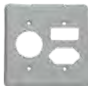
13PL5/2iT 23PL5/2iT 43PL5/2iT